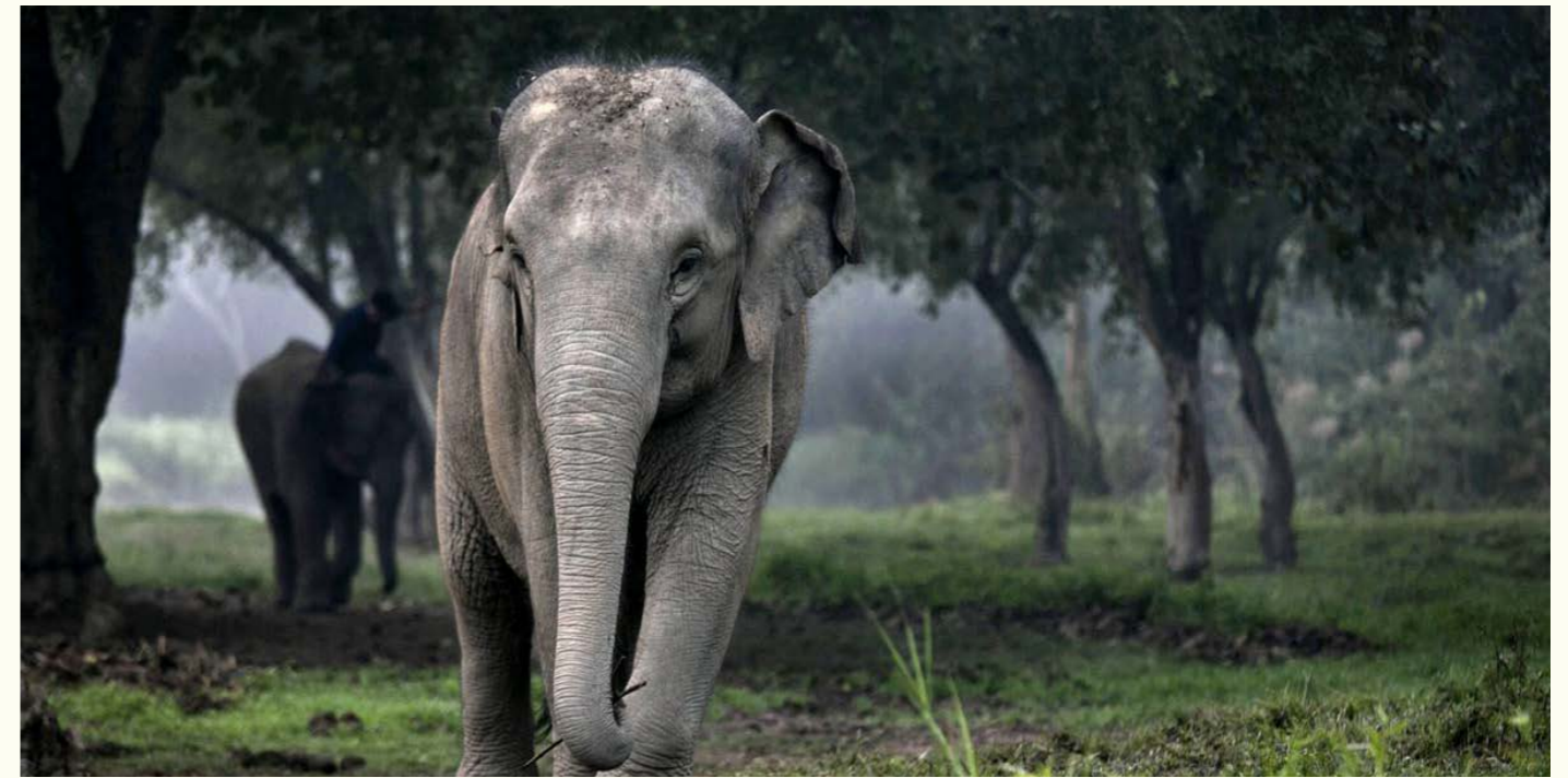
LANNA KINGDOM ELEPHANT SANCTUARY | 兰纳王国大象营

Once in a lifetime experience with these gentle giants. Join their daily routine which includes health inspection, feeding, bathing and walking with the elephants. You will be able to observe them interacting among their peers in their natural habitat.