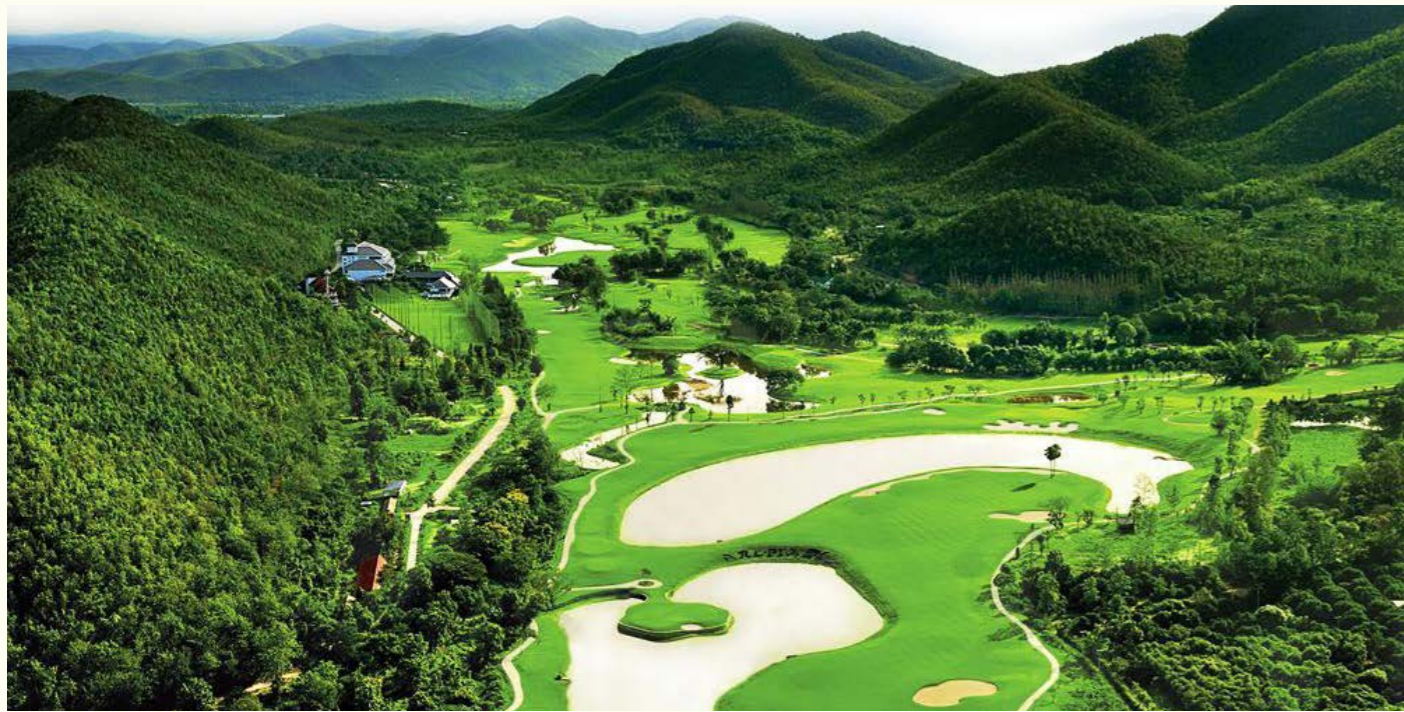
ALPINE GOLF RESORT CHIANG MAI | 清迈高山高尔夫度假胜地